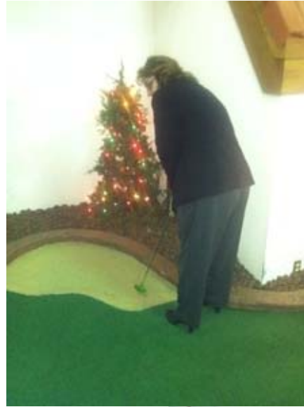
Members in attendance at work and play~